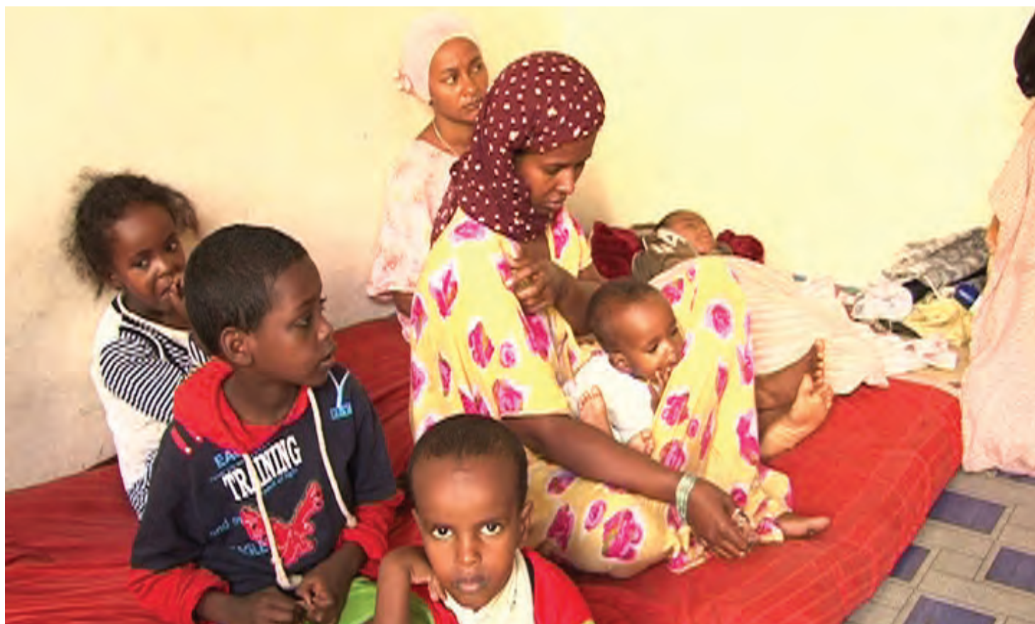
Whole families can live in just one room in Eastleigh