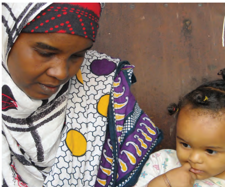
Government child growth monitoring and immunization campaign at the Eastleigh Community Wellness Centre in Nairobi

Migration can be defined as “a process of moving, either across an international border, or within a State. It is a population movement, encompassing any kind of movement of people, whatever its length, composition and causes; it includes the migration of refugees, displaced persons, uprooted people and economic migrants” (IOM, 2004).